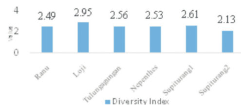
Fig 2. The diversity index of each transect

transect, Ranu transect was lowest (0.42) and Tulungagung transect was highest (0.88) (Fig 3).