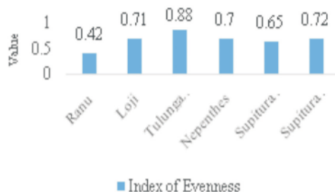
Fig 3. Index evenness of each transect

A comparison will have full similarity if index of similarity value equals one. There were different values of index similarity due to different habitat types in each transect, other than that bird cruising rate and adaptability influence to birds encounter in each transect (Soendjoto et al. , 2015; Adelina et al. , 2016; Wulandari and Kuntjoro, 2019).